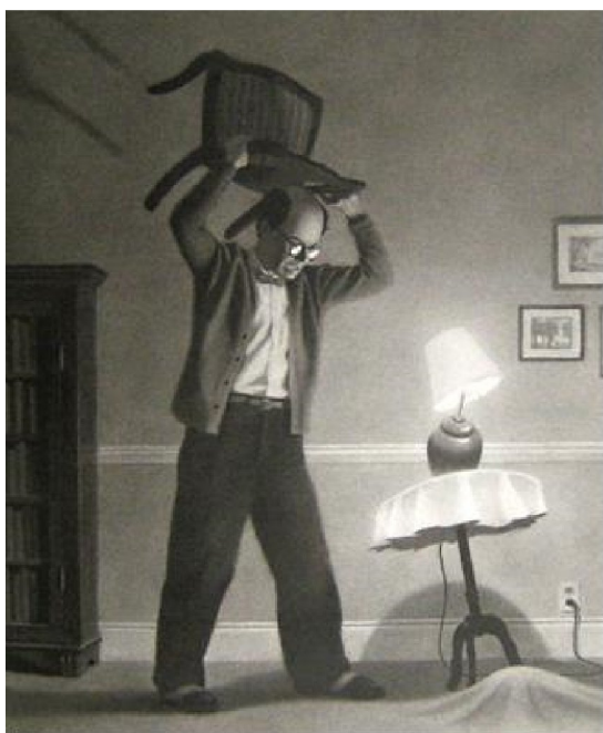
Taken from The Mysteries of Harris Burdick by Chris Van Allsburg

What is happening here? How can you tell that the men are putting in a lot of effort? Why does the man at the back only have one hand on the rope? How can you tell that these men belong to a club or group? What is the weather like?